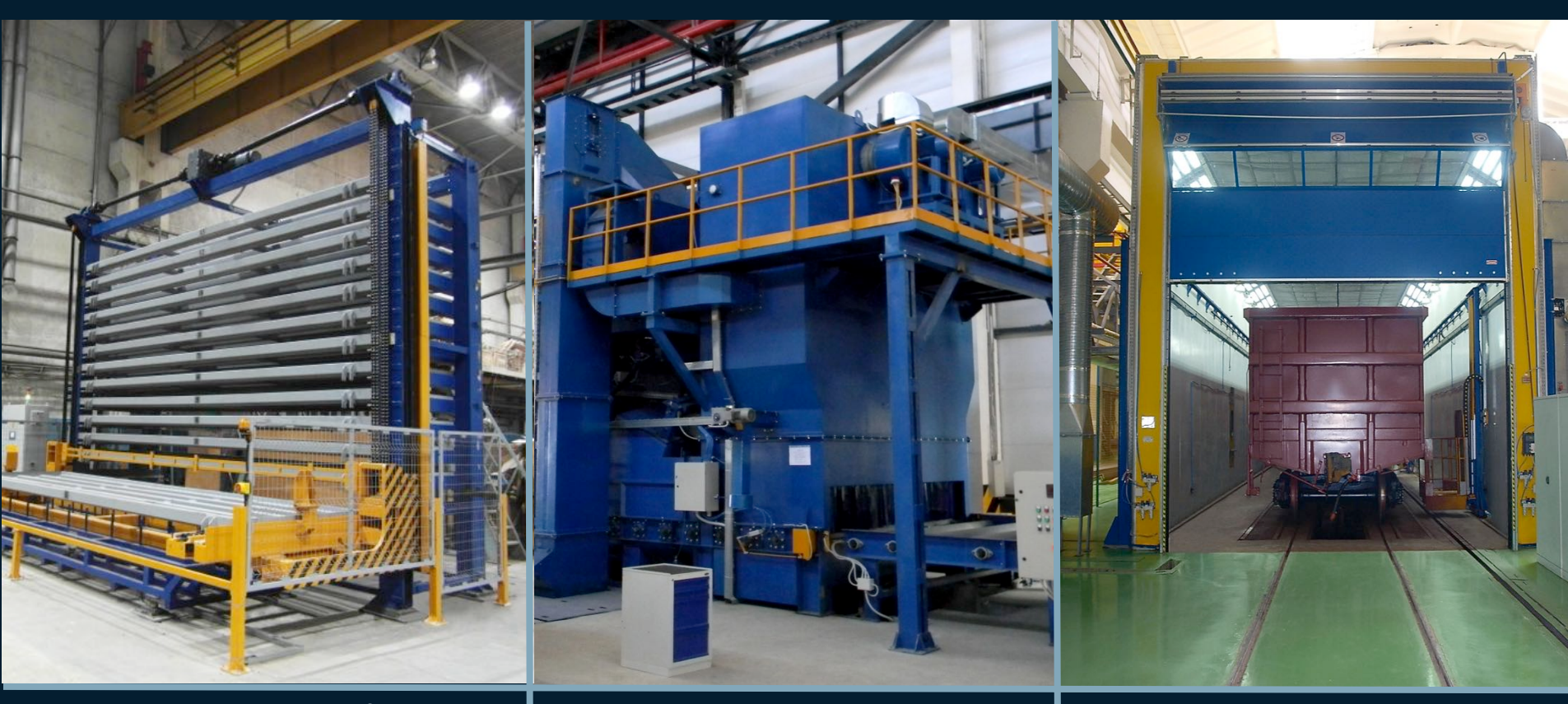
Mechanized storage systems for metal-roll