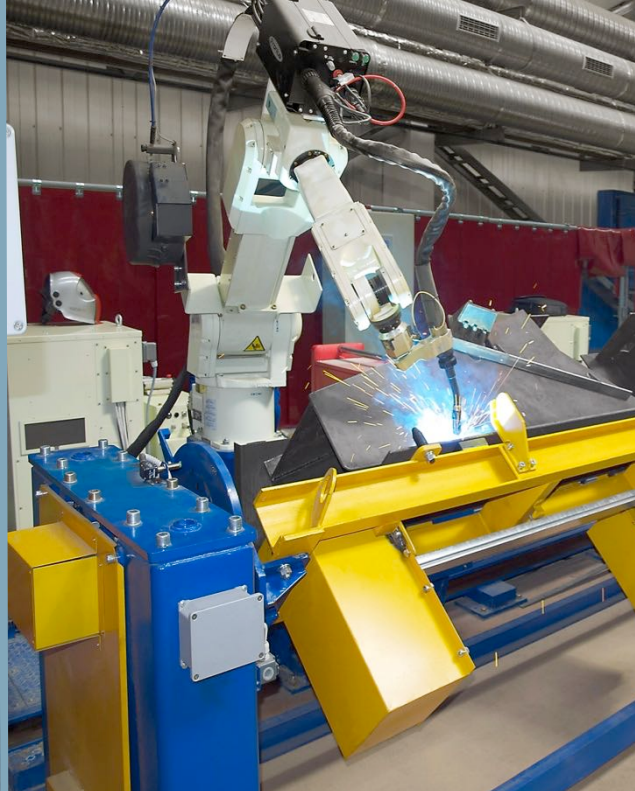
Robotic welding centers