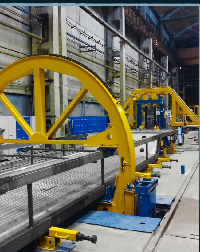
Special process equipment