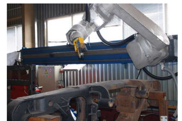
Spray-painting process robotization