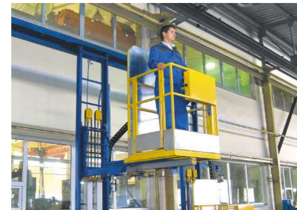
Lift-trucks for operators