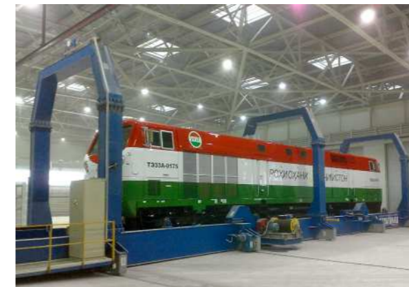
Transfer table, load capacity 150t